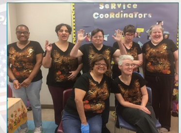
Residential Consumers Enjoy Harvest Festival (pg 6)