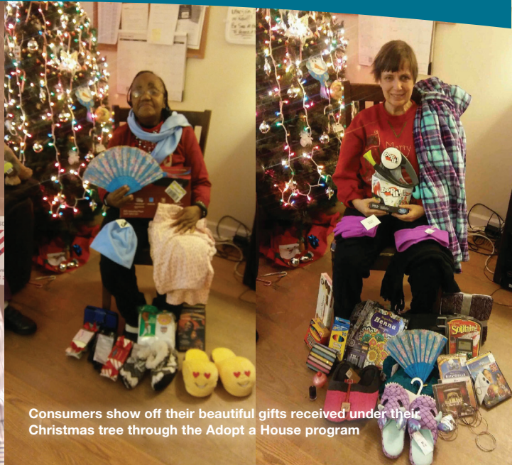
Consumers show off their beautiful gifts received under their Christmas tree through the Adopt a House program