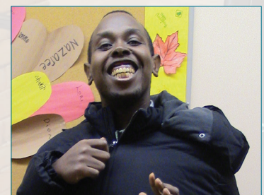
Coat Drive Warms the Hearts of Consumers (pg 6)