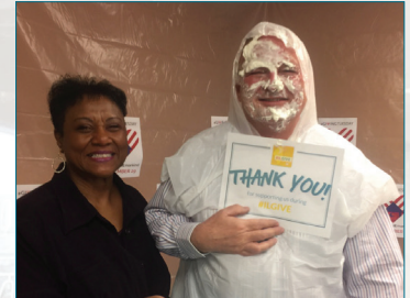
Sertoma Centre Celebrates Giving Tuesday Success (pg 5)

Sertoma's Mental Health First Aid Training Unites Police and Community (pg 4)