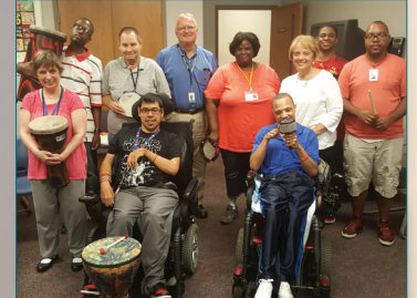
Sertoma Centre is Drumming for Joy at Music Room Dedication (pg 4)

Bride Gives Back Before Saying I Do (pg 6)