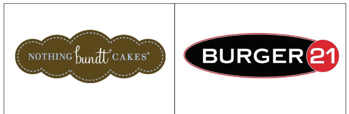
Thank you Nothing Bundt Cakes of Oak Lawn and Orland Park and Burger 21 for opening your doors and your hearts to Sertoma Centre.

Over the last several months, local restaurants, Nothing Bundt Cakes of Orland Park and Oak Lawn, as well as Burger 21 of Orland Park designated a day during their normal open hours to donate ten percent of all proceeds back to Sertoma Centre. Nothing Bundt Cakes of Oak Lawn and Orland Park also attended two of our biggest fundraisers of the year and gave ten percent of the proceeds they earned back to the agency. Thank you Nothing Bundt Cakes and Burger 21 for your kindness and generosity and believing in Sertoma Centre's mission to empower individuals with disabilities.