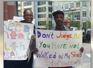
CMHC Celebrates Mental Health Awareness Month (pg 5)