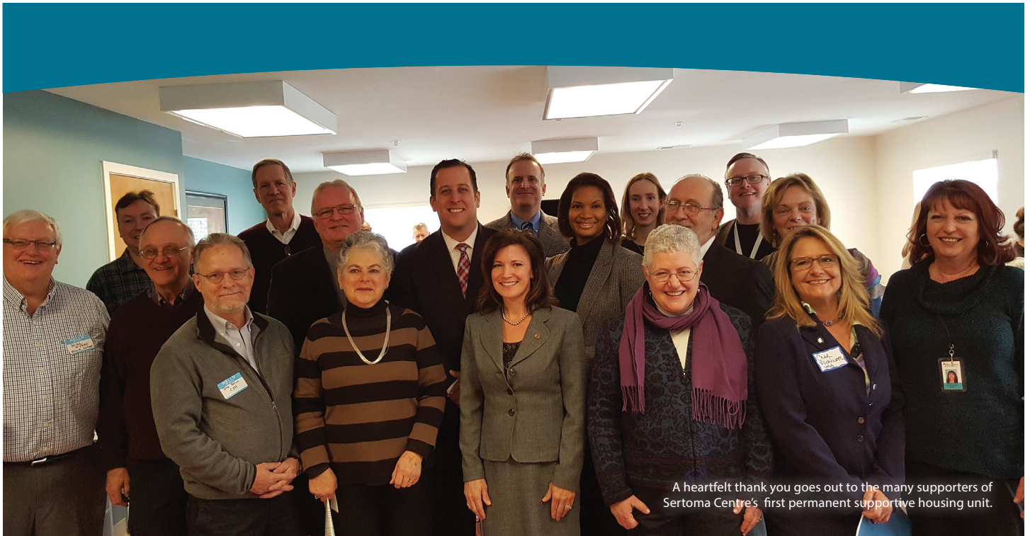
A heartfelt thank you goes out to the many supporters of Sertoma Centre's first permanent supportive housing unit.