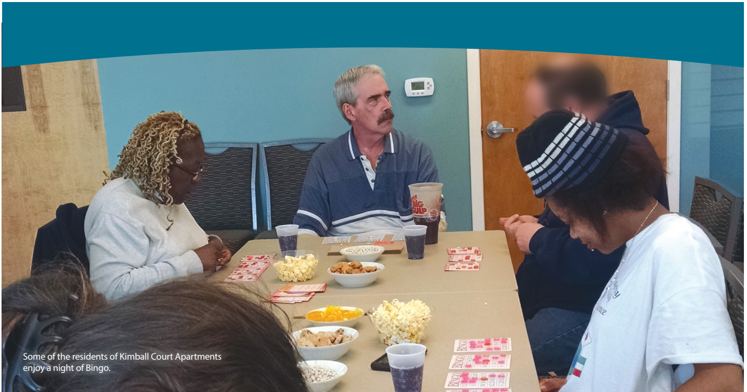
Some of the residents of Kimball Court Apartments enjoy a night of Bingo.