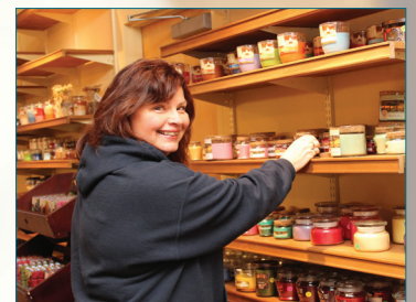
Housewares Show and Super Sale Huge Success (pg 8)