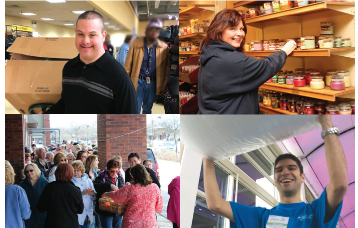
Housewares Show volunteers packed up the deals and brought back the savings to Super Sale!

After unpacking many, many boxes (again, THANK YOU VOLUNTEERS!) and sorting merchandise, our residential home managers came to the store and went "shopping" for necessities for our consumer homes. They were able to bring back new convection ovens, coffee makers, towels, pots and pans, silverware, tableware, bakeware, glasses and mugs, cleaning supplies, décor, kitchen accessories and some party goodies! Even some donated tables, chairs, book shelves and benches made it into our CILA homes as well as our new 16-unit independent-living apartment complex. Our staff also prepared for different fundraisers throughout the year by hand-picking items for raffle prizes and baskets.