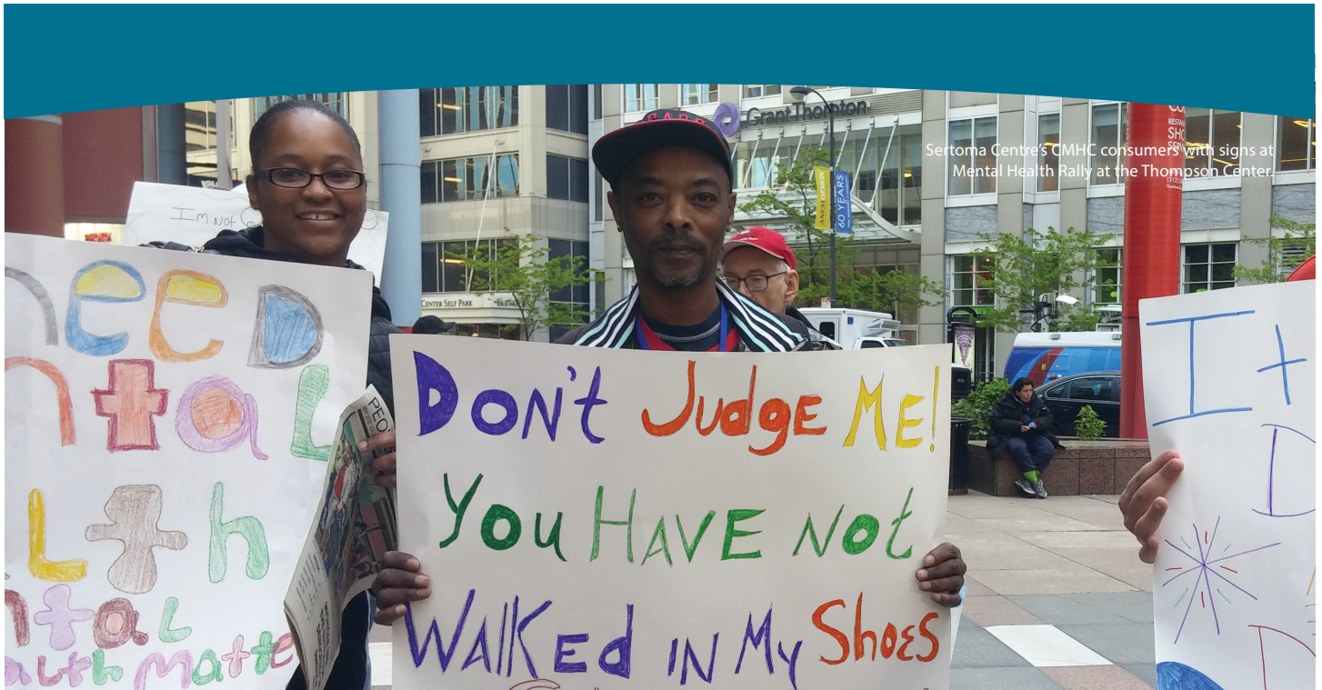
Sertoma Centre's CMHC consumers with signs at Mental Health Rally at the Thompson Center.