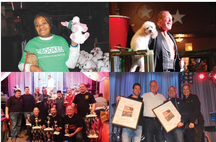
Our biggest fundraiser of the year The BIG Event and Firefighters' Cook-Off 2016. Fun for all!

This year marked Sertoma Centre's 12th annual BIG Event, which featured an award-winning cook-off with Chicagoland firefighters, the BIG Raffle, music by The Kennedy Compound, a special kids' activity area and other spectacular entertainment.