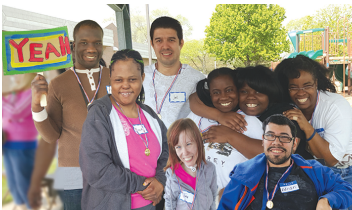
123rd consumers cheer on consumers on the trail at the 4th Annual Autism Walk-a-Thon.