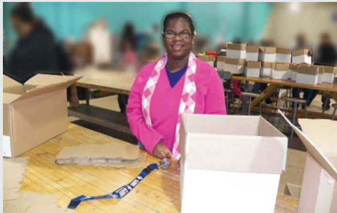
Consumers are trained on a variety of equipment and complete contracts from various vendors, respecting both deadlines and quality control issues.

But Sertoma's Developmental Training Program provides so much more than that! Currently, self-advocacy and person centered planning education has increased consumer awareness and choice in programming. Consumers are running their own classes in reading, math, computer literacy and crochet. A variety of classes are consistently offered year-round focusing on increasing educational abilities (such as math,