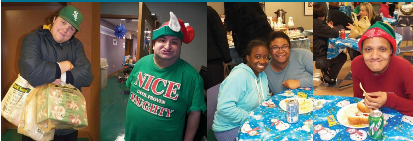
Shopping, eating, and celebrating was the plan for the day!