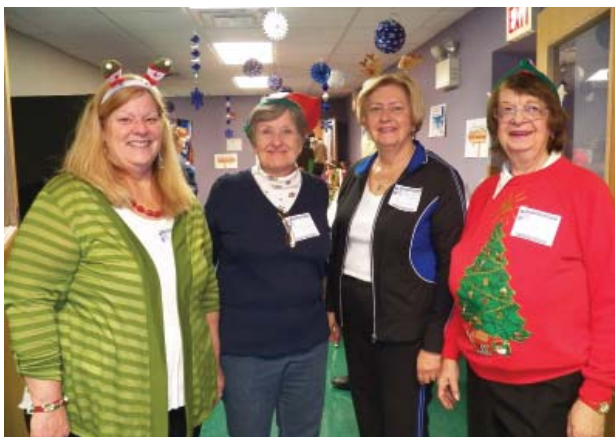
Holiday Bazaar volunteers made this event a huge success.

lunch and break monitors, parking lot attendants, filing and paperwork needs, data entry, marketing strategies and slots on various planning committees. We are always looking for new and creative ways to empower our consumers to achieve personal success and volunteers are a huge part of this effort. In the New Year, make a resolution you want to keep and volunteer this year with Sertoma Centre.