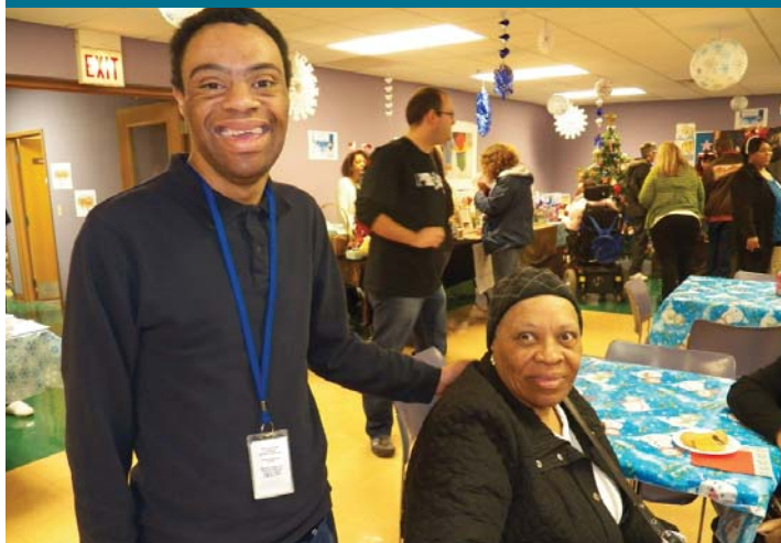
Consumers had an opportunity to shop for family and friends at the bazaar.