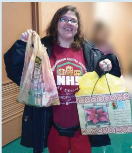
Buying gifts for friends and loved ones bring joy to our consumers.

love. That was the sole driving force behind the Holiday Bazaar-giving everyone the chance to spread their own holiday magic for the people they care about.