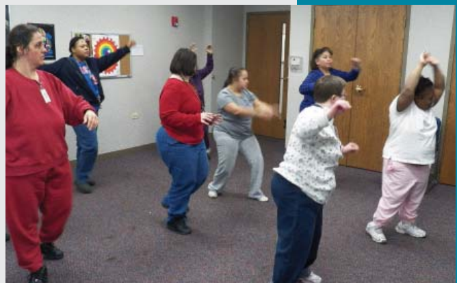
Dancing class is great exercise and builds self-esteem.