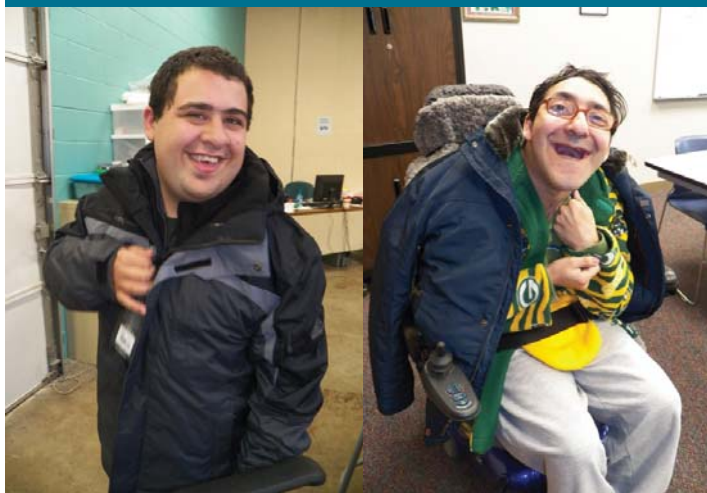
Generous donations provided warm coats and food baskets this holiday season.