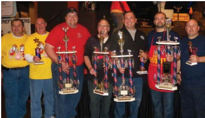
2012 Firefighter Cook-off Winners

Firefighters, we need your delicious ribs, sensational chicken, ethnic dish or firehouse chili. If you are a firefighter or know someone who is a firefighter, then consider competing in the hottest firehouse cook-off on the south side. Trophies and prizes are awarded for each category: chicken, ribs, chili, and ethnic dishes. Chefs are required to prepare sample size portions for 500 people and are reimbursed up to $500 for food expenses.