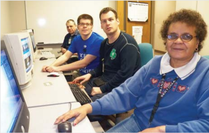
Consumers lead their own classes in computers, increasing educational abilities.

Developmental Training provides a vast array of options to individuals with disabilities. One option is a full work component. Consumers are trained on a variety of equipment and complete contracts from various vendors, respecting both deadlines and quality control issues. Another option is a full curriculum based program, where consumers engage in a variety of activities aimed at increasing community integration, skills building and adaptive living skills. This is what most people expect from a workshop setting.