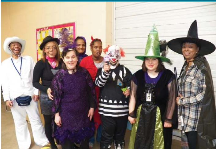
Consumers and staff in Developmental Training are dressed for tricks & treats.