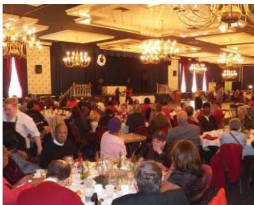
Over 300 people attended.

Sertoma consumers know how to have a good time. They enjoy good food, great music, and a nice awards presentation. However, if you throw in a photo booth and a Michael Jackson impersonator, then you really have a Party . The more than 300 guests who attended this event had an awesome time at the Lexington House in Hickory Hills on Dec. 2.